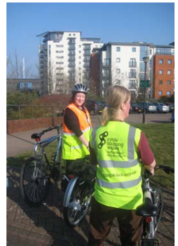
Cycle training at County Hall

The first buying window for the Council’s Cycle To Work scheme was held in February, with over 150 from across staff across Cardiff Council taking advantage of the opportunity to purchase bikes and cycling equipment at reduced cost.